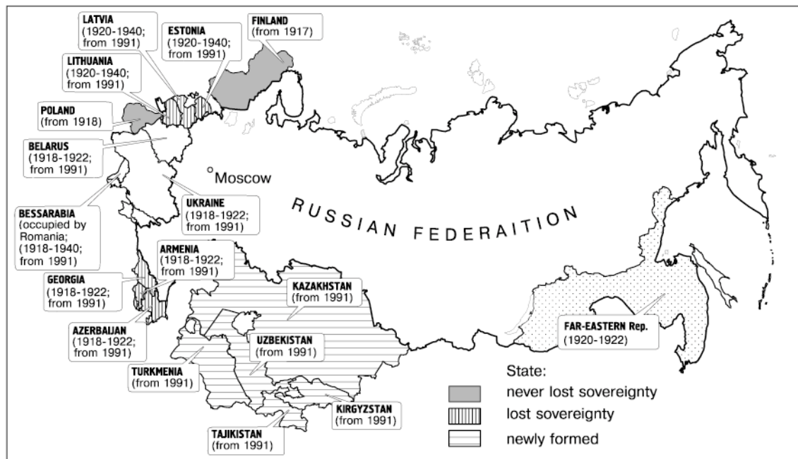
Map: Desintegration, Restoration and new Desintegration