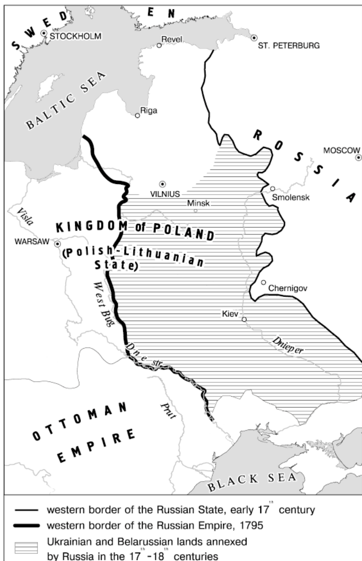
Map: Collection of Lands, 17 th -18 th Centuries