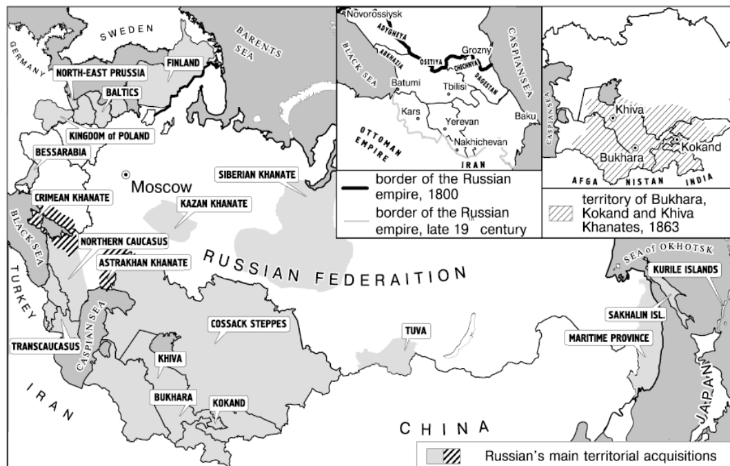
Map: Strategic Borders