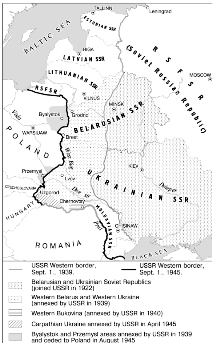
Map: Collection of Russian Lands, 20 th Century