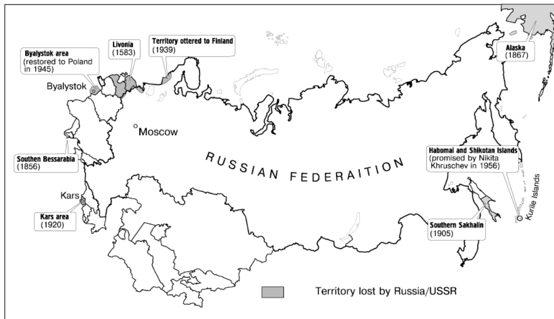
Map: Territorial Concessions