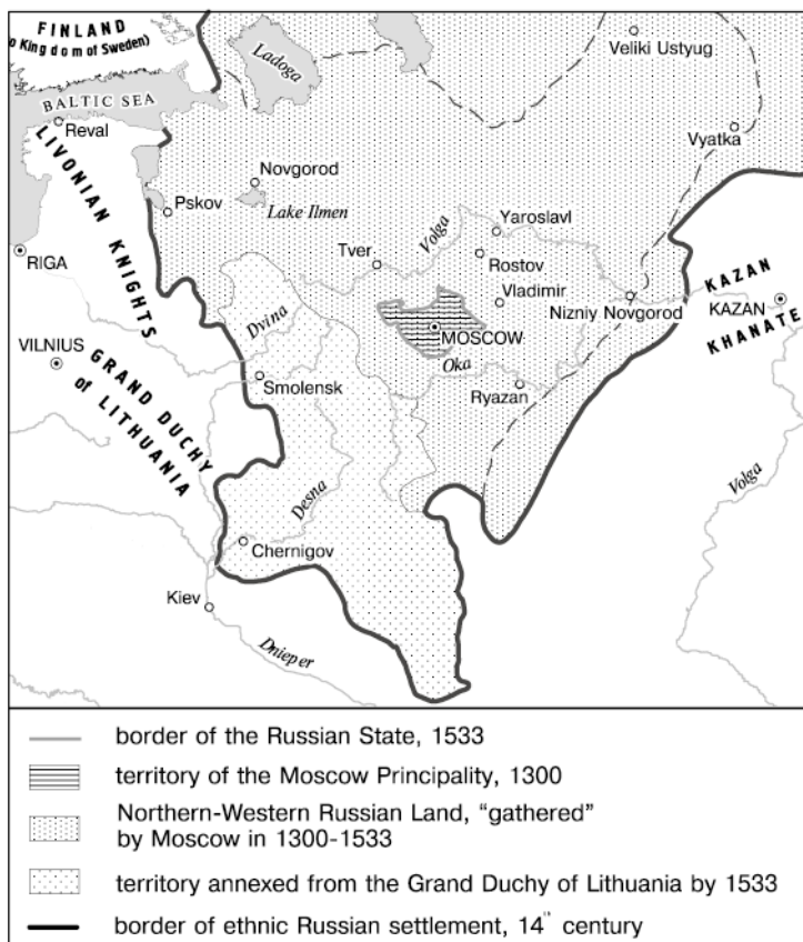
Map: Collection of Russian Lands, 14 th -16 th Centuries